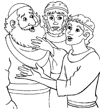
THE PRODIGAL SON Luke 15

"A man had two sons. The youngest said, 'Give me my part of your riches.' The son left, and spent all of his money foolishly."